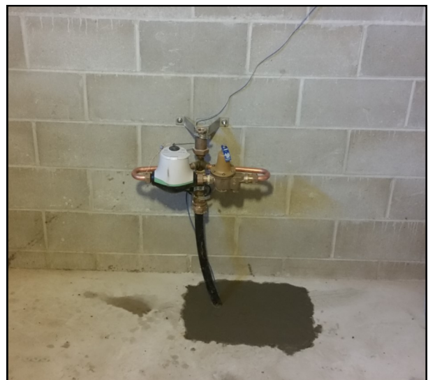
A typical basement meter installation

If you are leaving the heat on in your house while you are gone, or if your meter is in a meter pit supplied by Clay RWS, and you would like to ensure you do not have any problems, you may request a Temporary Disconnect. We will turn the water off to your property at your service line valve. Cost for this service is $25.00 and is billed when the water is turned off. The monthly minimum on your water bill is due each month.